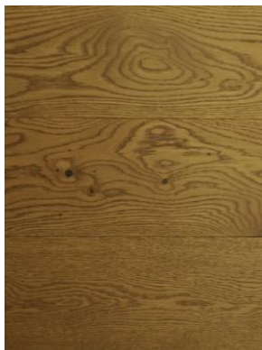
Renfrew White Oak