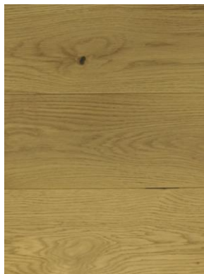
Wasaga White Oak