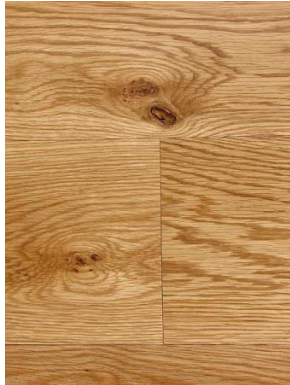
Natural White Oak