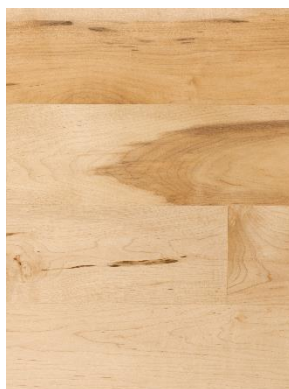
Natural Hard Maple