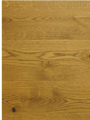
Rainy River White Oak