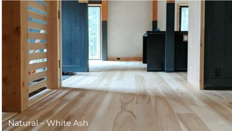
Natural – White Ash