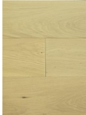
Dufferin White Oak