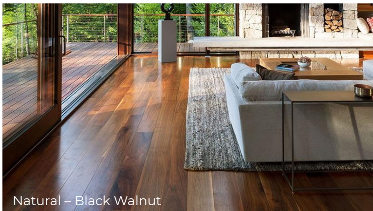
Natural – Black Walnut