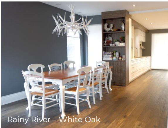
Rainy River – White Oak