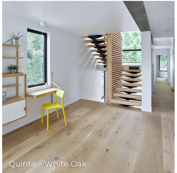
Quinte - White Oak