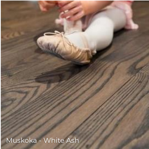
Muskoka - White Ash