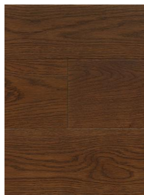
Grand Bend White Oak