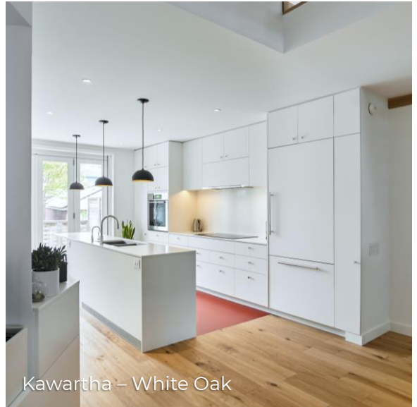
Kawartha - White Oak