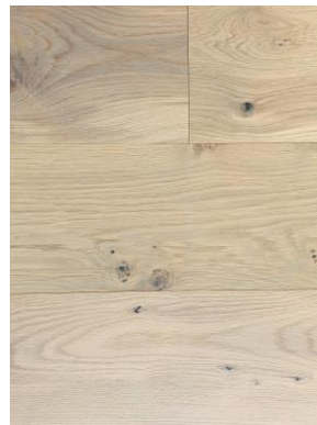
Temagami White Oak