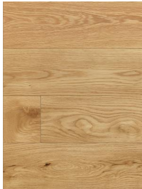
Natural White Oak

Notes ◦ All products are available in Solid Strip flooring; 2-1/4" – 6-1/4" wide, up to 12' lengths