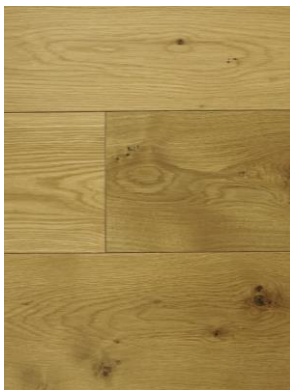
Kawartha White Oak