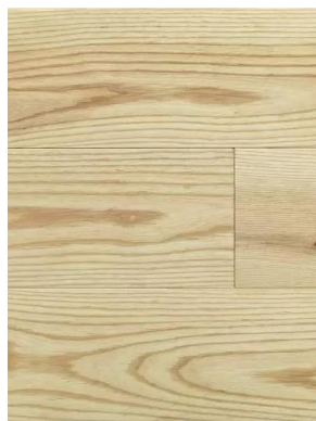
Natural White Ash