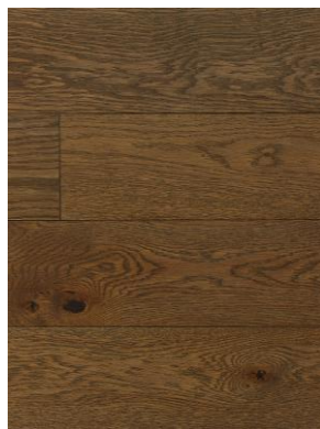
Muskoka White Oak