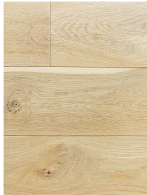
Quinte White Oak