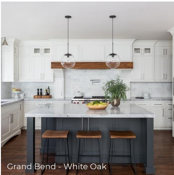
Grand Bend - White Oak