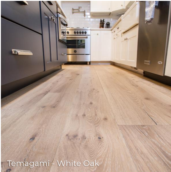
Temagami - White Oak